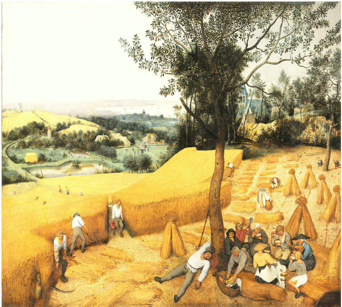
The Harvesters. Pieter Bruegel, 1565.

For more news, additional announcements, worship video recordings, and other information, please visit us on the web at: www.stspeterandpaulriverside.org .