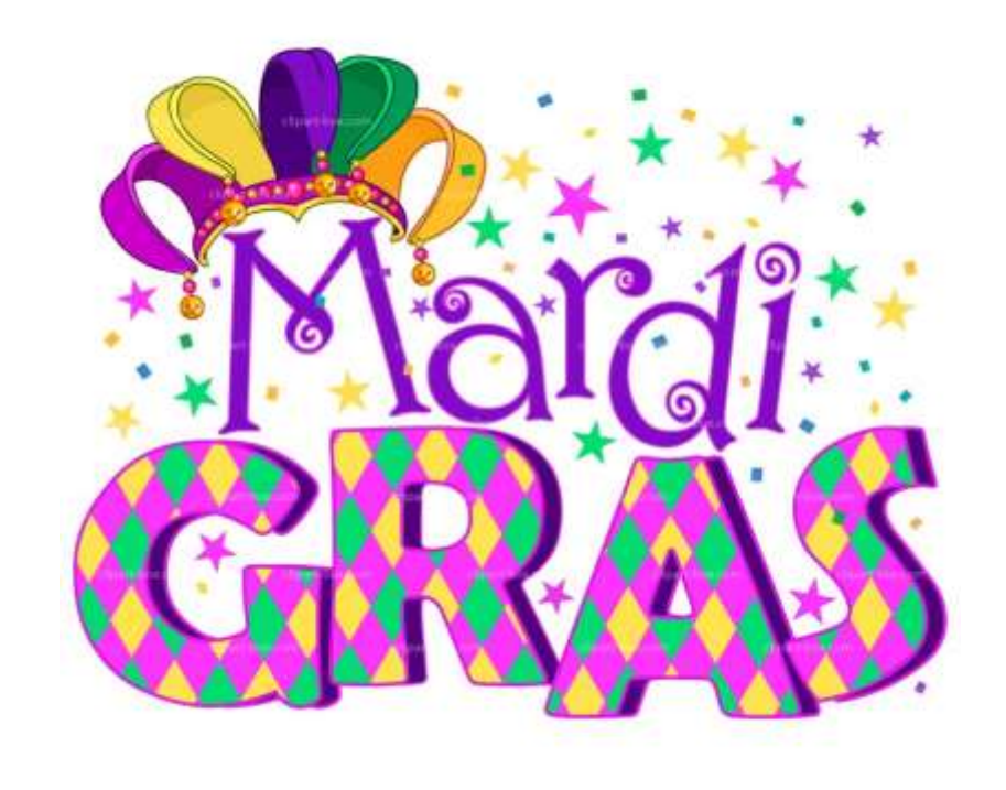
Saturday Evening, March 1st, 5:30-9:30 p.m. Dinner, Dance and Raffle in the church dining hall.