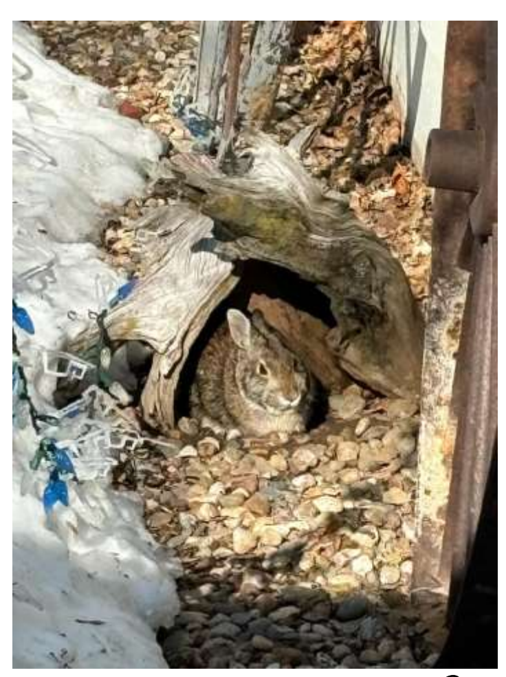
No, this is not the groundhog. \odot

"Do not judge, and you will not be judged; do not condemn, and you will not be condemned. Forgive, and you will be forgiven; give, and it will be given to you. A good measure, pressed down, shaken together, running over, will be put into your lap; for the measure you give will be the measure you get back."