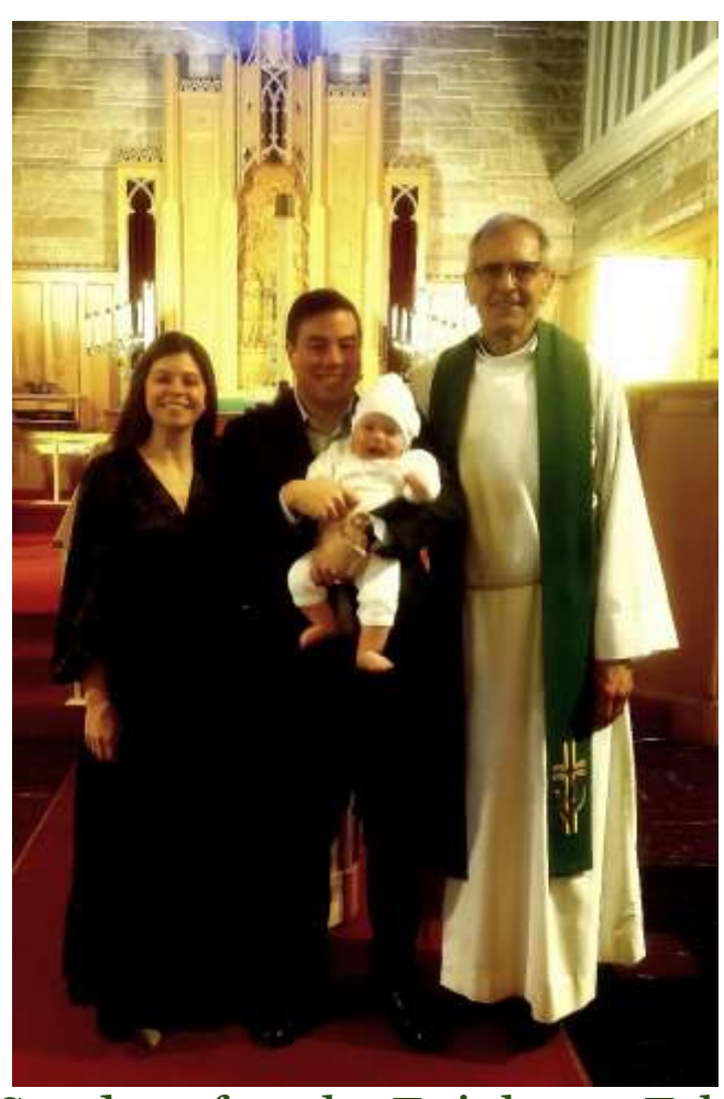
The Sixth Sunday after the Epiphany, February 16th