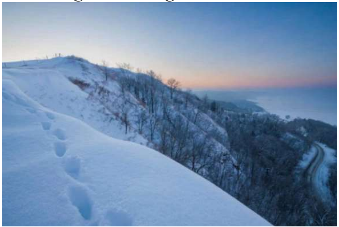
Loess Hills in Winter on the Missouri River Valley, Monona County, Iowa