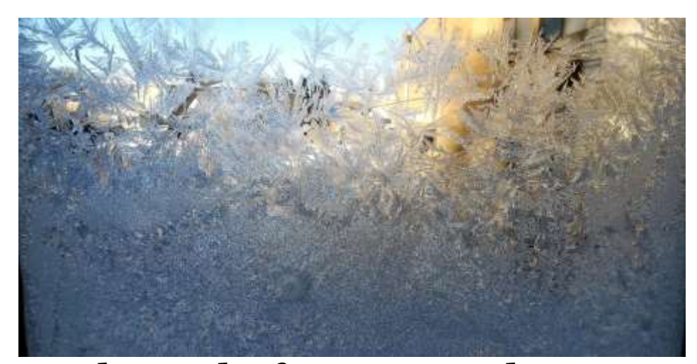
The week of January 14th, 2024