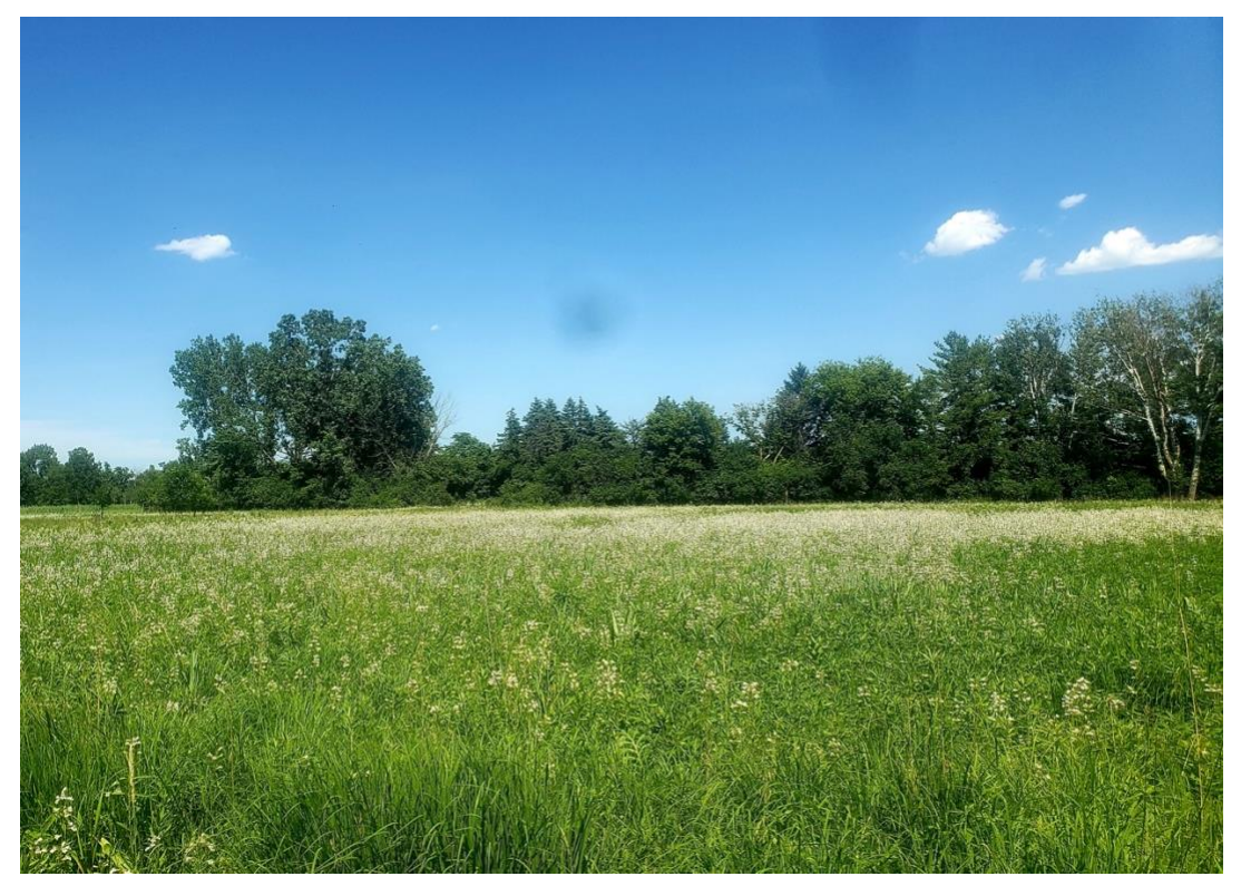
Wild flower meadows north of the Brookfield Zoo.