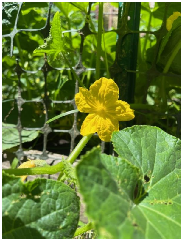
Cucumber vine blossoms in the church garden.

Seedlings<sup>♥</sup>: "The Sun never says... 'You owe me'"