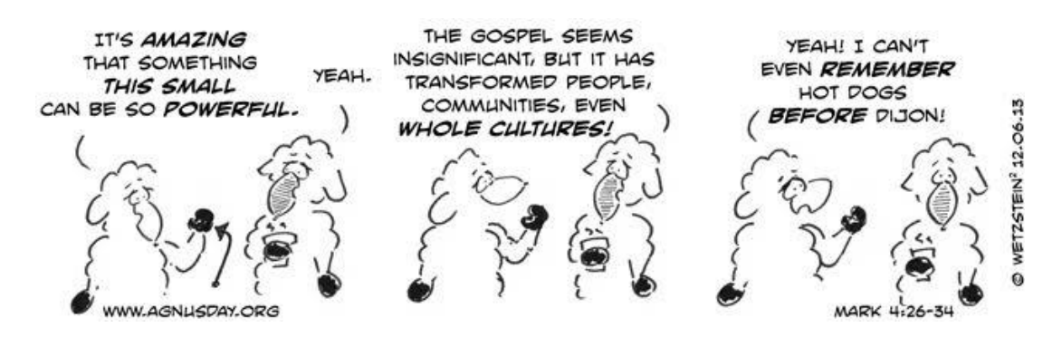
[Jesus] also said, "The kingdom of God is as if someone would scatter seed on the ground, and would sleep and rise night and day, and the seed would sprout and grow, he does not know how. The earth produces of itself, first the stalk, then the head, then the full grain in the head. But when the grain is ripe, at once he goes in with his sickle, because the harvest has come."

He also said, "With what can we compare the kingdom of God, or what parable will we use for it? It is like a mustard seed, which, when sown upon the ground, is the smallest of all the seeds on earth; yet when it is sown it grows up and becomes the greatest of all shrubs, and puts forth large branches, so that the birds of the air can make nests in its shade."