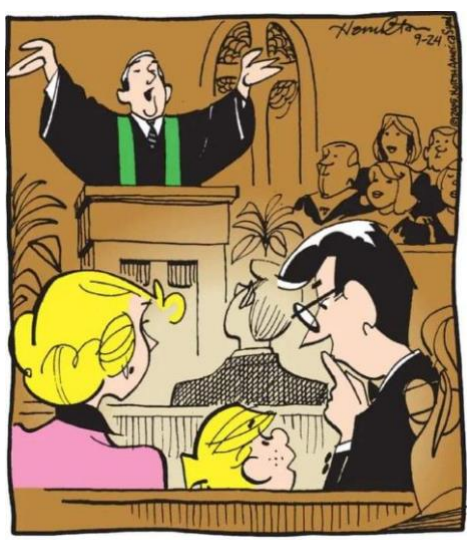
"IF WE GIVE HIM HIS MONEY NOW, WILL HE LET US GO HOME EARLY ?"