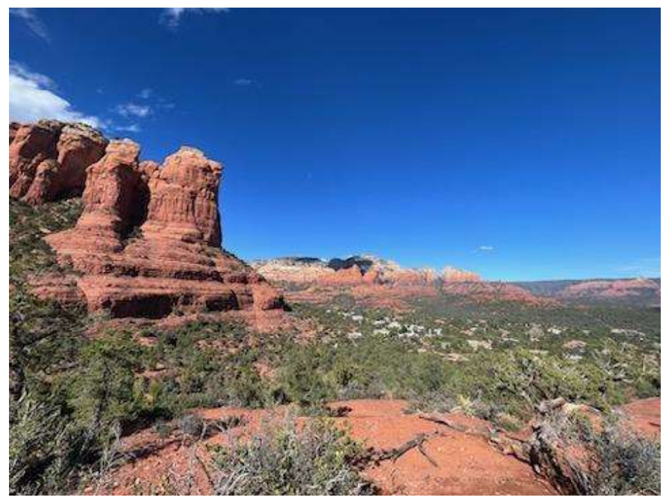
"The King Shall Come When Morning Dawns" You may listen by clicking on the above link or HERE.