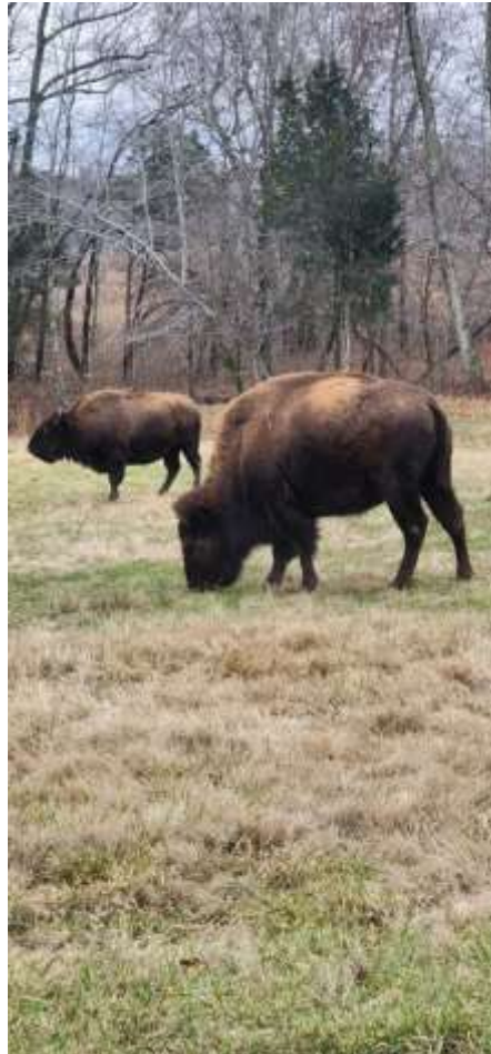
Black Hills Buffalo

The Twentieth Sunday after Pentecost, October 6th with the Blessing of Animals in Commemoration of St. Francis of Assisi, October 4th