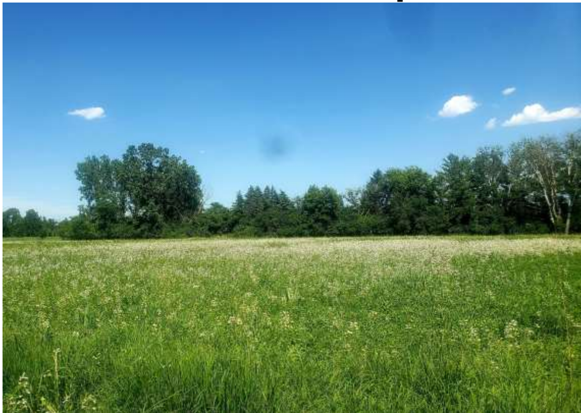
Wild flower meadows north of the Brookfield Zoo.