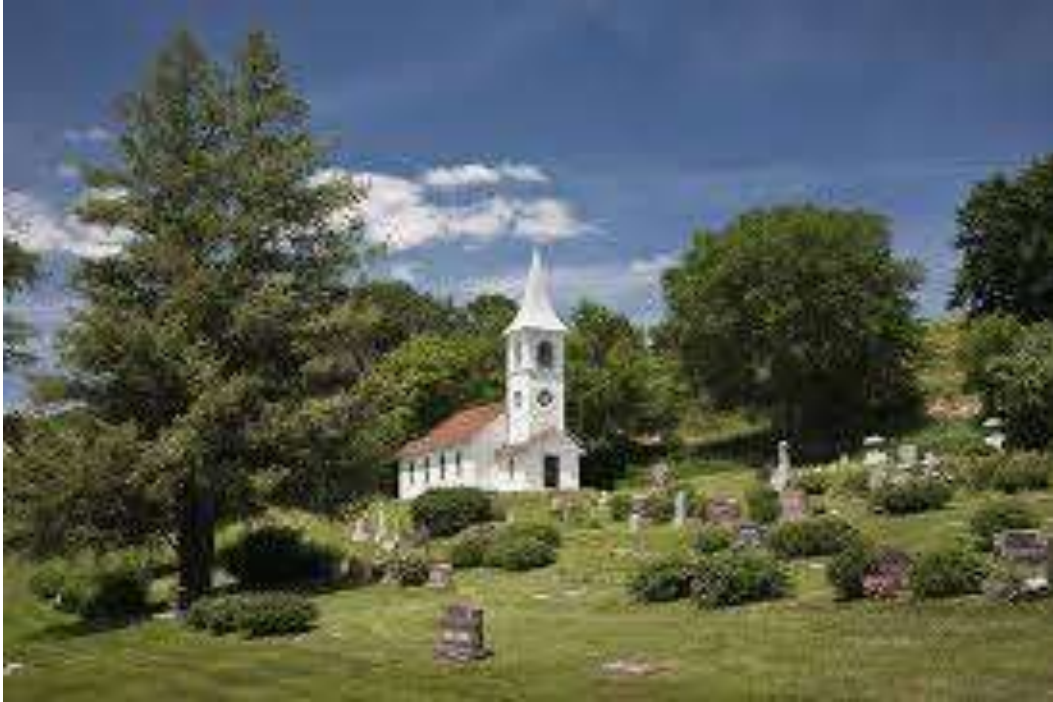
Ingemann Danish Lutheran Church in Monona County, Iowa