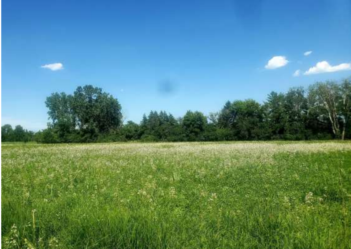
Wild flower meadows north of the Brookfield Zoo.