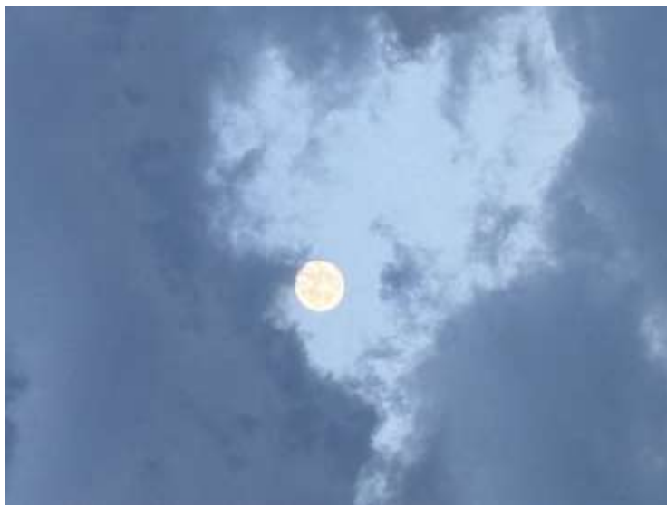
Harvest Moon in September

Francis had a spirit of gratitude for all of God's creation.