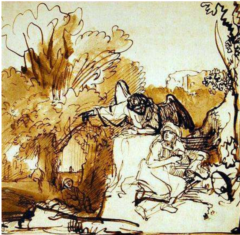
The Angel Appearing to Hagar and Ishmael by Ferdinand Bol

(by John O'Donohue in To Bless the Space Between Us )