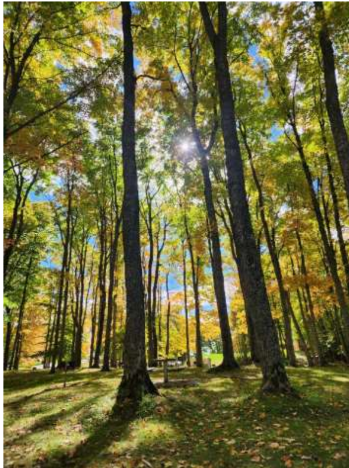
A Blessing of Angels