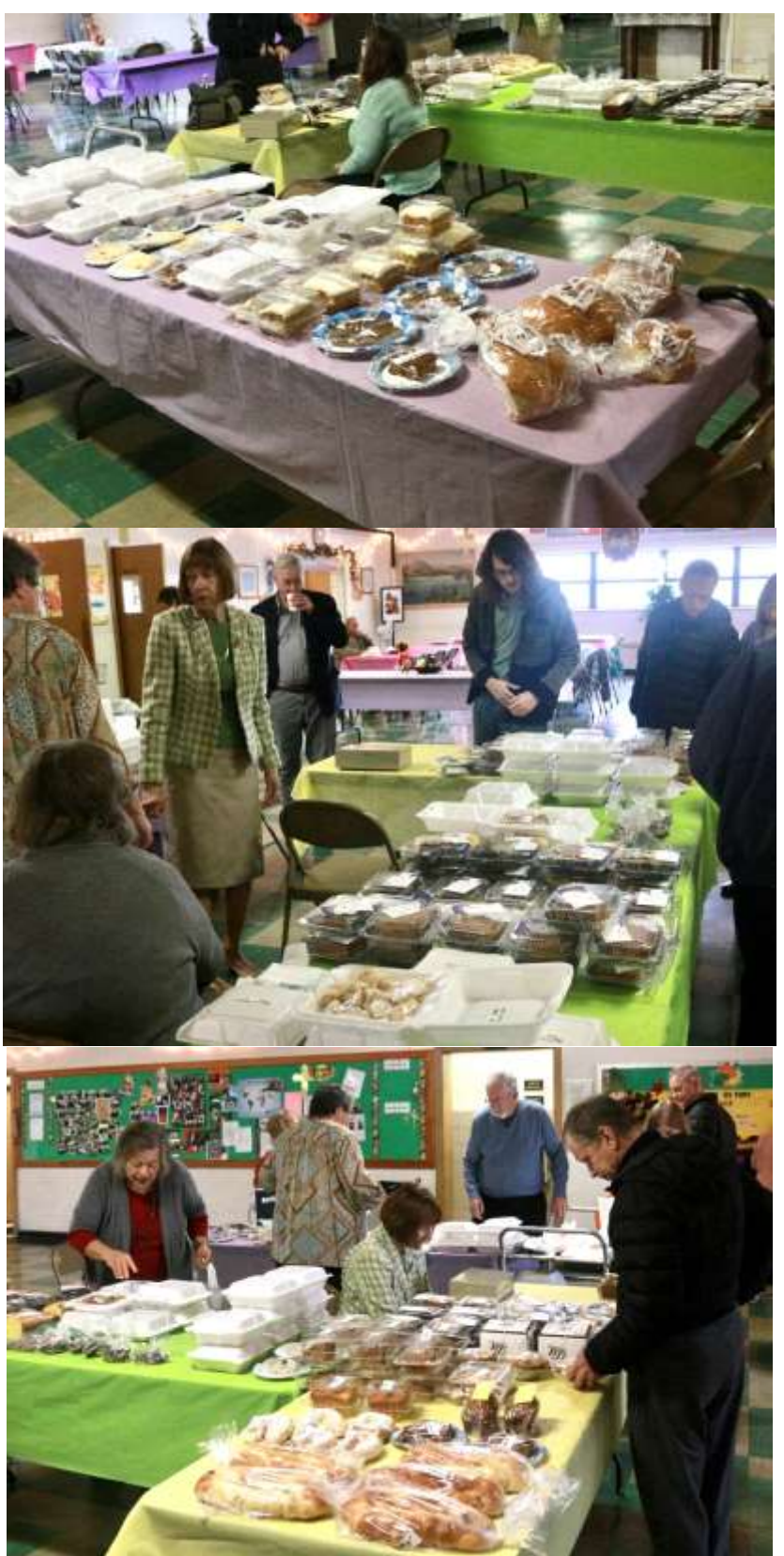
Pre-Holiday Bake Sale on Christ the King Sunday, November 24th