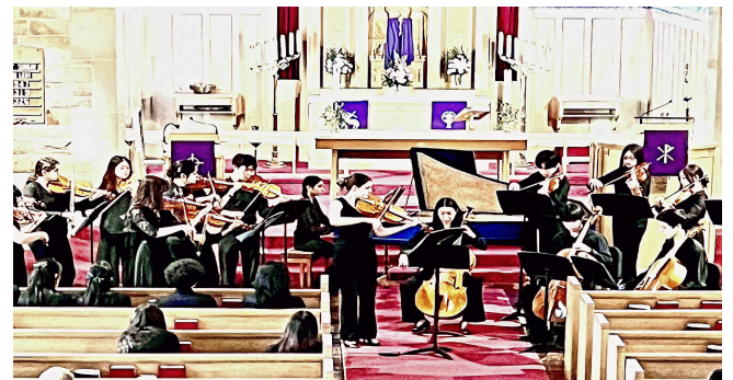
The Baroque String Ensemble and Viol Consort from Stevenson High School in Lincolnshire performed in concert here on March 9 th.