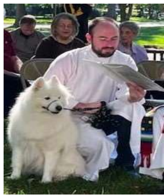
Above: October 2023 outdoor worship with the blessing of animals.

Join us for the final open air worship service of 2024 in the church gardens with the blessing of pets and animals. You are welcomed and encouraged to bring a beloved pet to the worship on this day. If you are not able to bring an animal, you may wish to bring a photo of an animal you love, a photo of an endangered species in the wild, or a photo of your deceased, beloved pet companion(s) to the service.