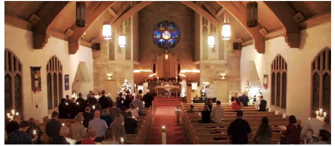
Christmas Eve 2023

The autumn chill is a reminder of several facility needs to keep the sanctuary and building warm and welcoming as well as safe and sound during the coming months of winter and in the years ahead. The most important and pressing projects include the following: