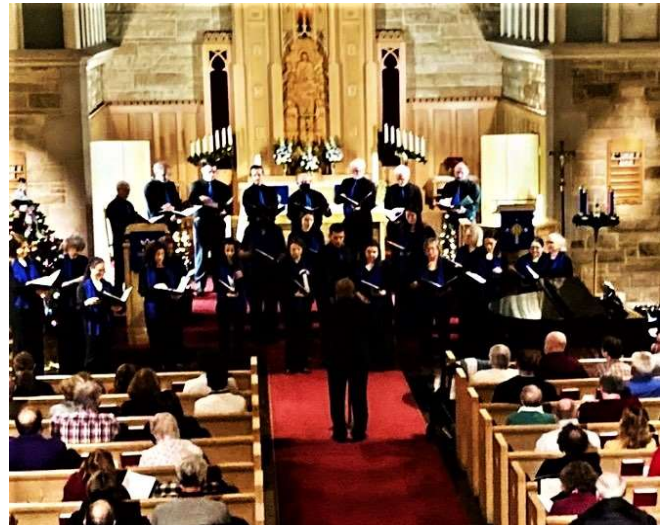
Lux Cantorum Chicago in concert at Sts. Peter and Paul in December 2022.

at Ascension Lutheran Church 400 Nuttall Road in Riverside 10:00 a.m. Lessons and Carols with Holy Communion (No liturgy here on Christmas Day)