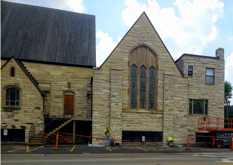
Tuck-pointing began on the north face of the building in early June.