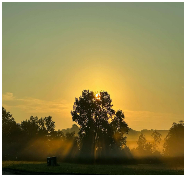
taken in early August at sunrise near Galesburg, Illinois.