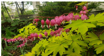
Bleeding Heart Plant in front of the parsonage during the month of May.

Heavenly Father, you entrusted your Son Jesus, the child of Mary, to the care of Joseph, an earthly father. Bless all fathers as they care for their families. Give them strength and wisdom, tenderness and patience; support them in the work they have to do, protecting those who look to them, as we look to you for love and salvation, through Jesus Christ our rock and defender. Amen