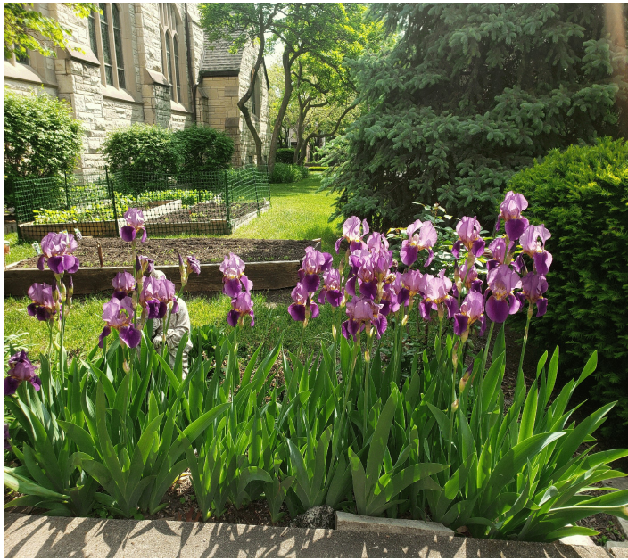
Iris blossoming on the church patio in May.