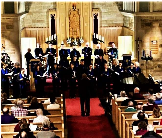
Lux Cantorum Chicago in concert at Sts. Peter and Paul in December 2022.