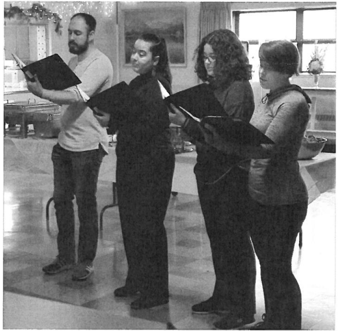
Singers from the Youth Choir perform before the Dinner.