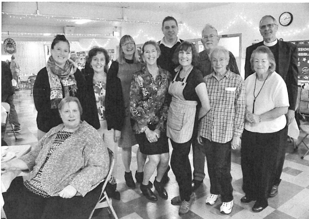
Mission Dinner Planning Group