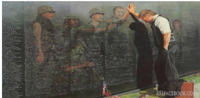
Vietnam War Memorial

Eternal God, we give thanks for all those who have shown the greatest love by laying down their lives for others. We especially thank you for those in our military throughout history who have sacrificed their lives for their fellow citizens and for us who came after. As we remember their service, keep us mindful of all those for whom this day is a burden, and send your spirit of comfort to them. Be present with all the women and men who are serving in the military today. Let them live for the peace known only from you. Help us to be worthy of their legacy, and keep us mindful of their service, that in all things we may live our lives in praise and thanksgiving to you; through Jesus Christ, our Savior and Lord. Amen.