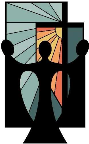
Saints Peter and Paul Logo Design by Paul Gavac.

A very strong proof of this destruction of death and its conquest by the cross is supplied by a present fact, namely this. All the disciples of Christ despise death; they take the offensive against it and, instead of fearing it, by the sign of the cross and by faith in Christ trample on it as on something dead (St. Athanasius, fourth century).