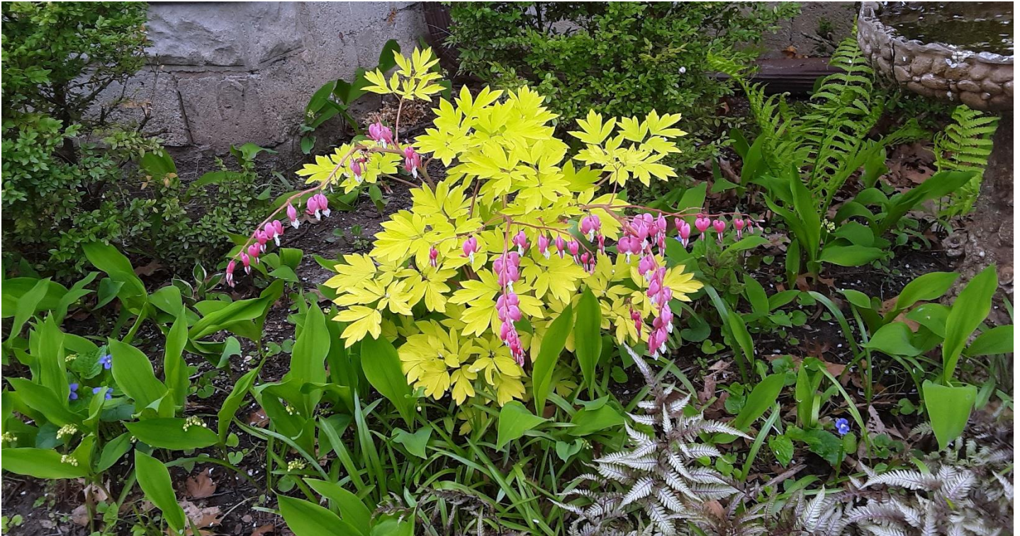
Bleeding hearts plant outside the parsonage in May 2020.

A Reading from the Book of Genesis 1:1---2:4a