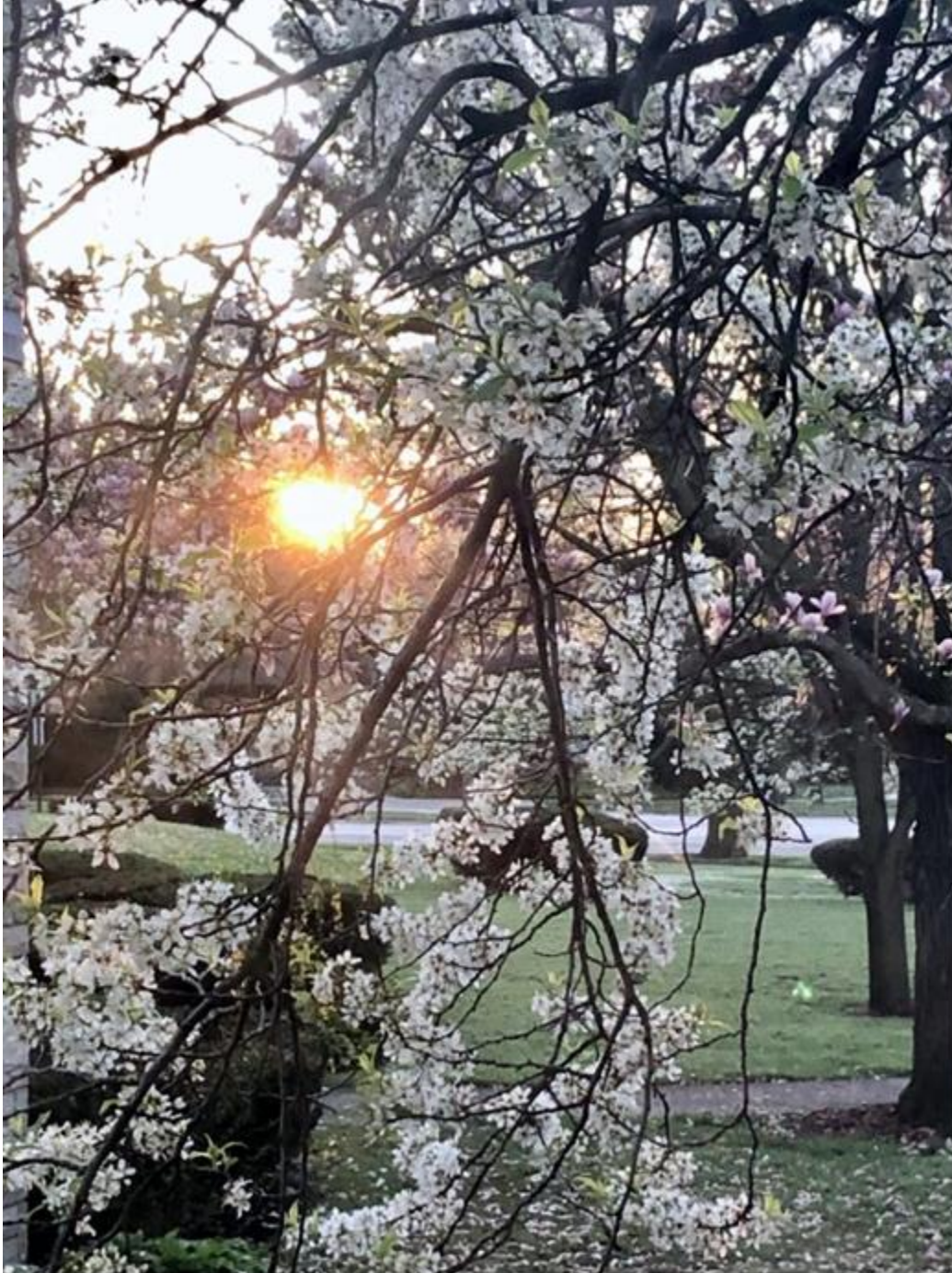
Sunrise Through the Plum Blossoms on the church grounds in May 2020.

Alleluia! Christ Is Risen! He Is Risen Indeed! Alleluia!