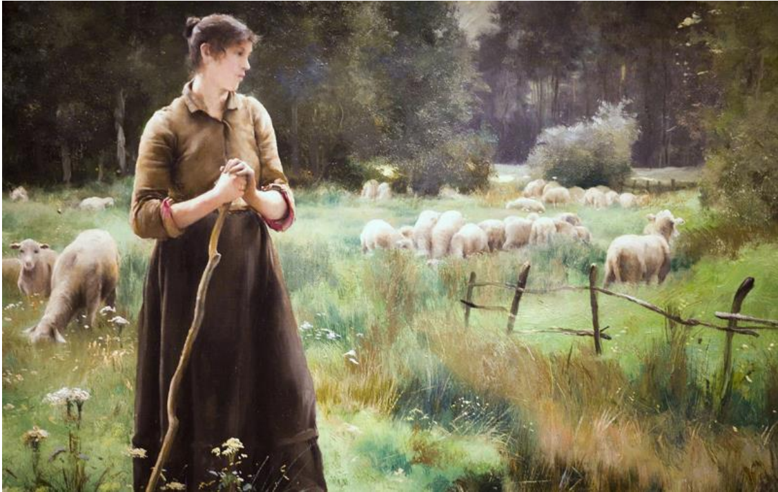
The Good Shepherd. Julien Dupre, 1851-1910.