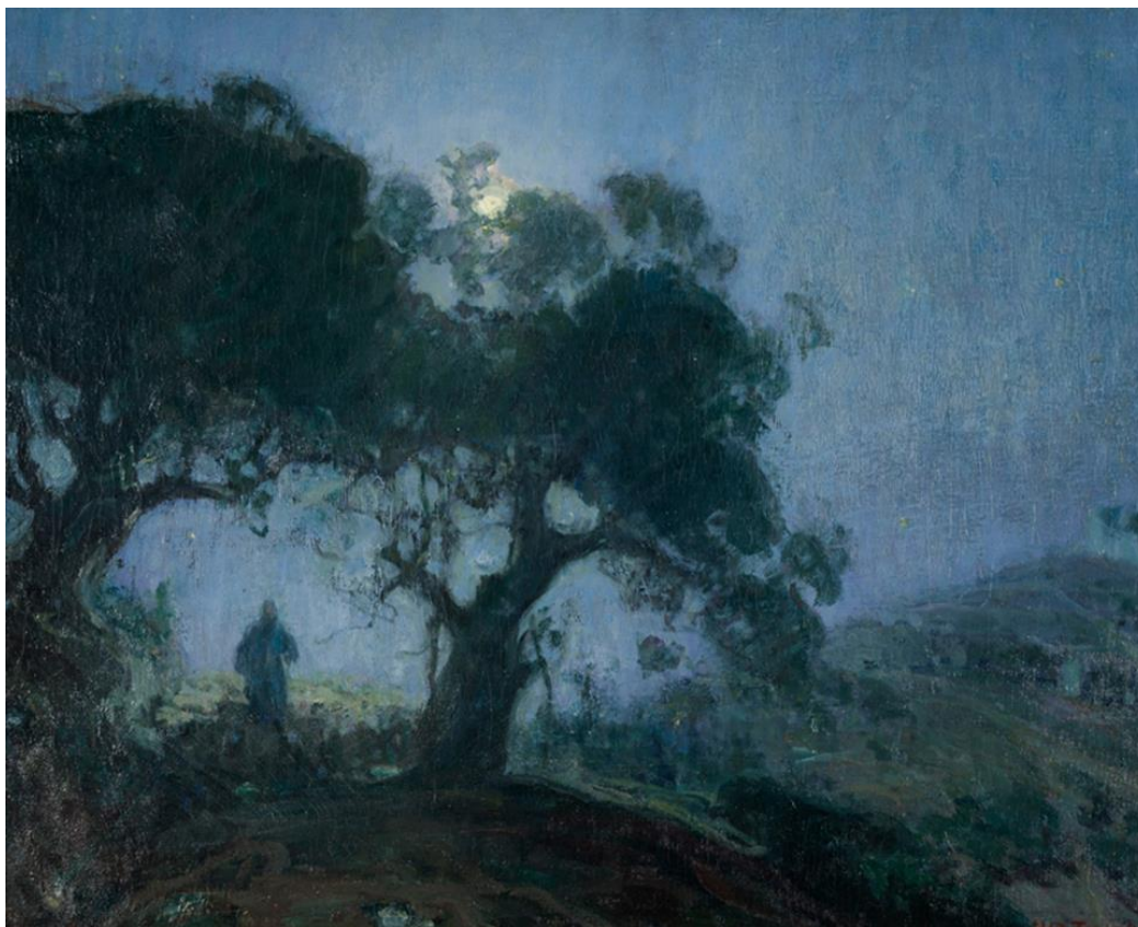
Good Shepherd, 1902-1903.

Alleluia! Christ Is Risen! He Is Risen Indeed! Alleluia!