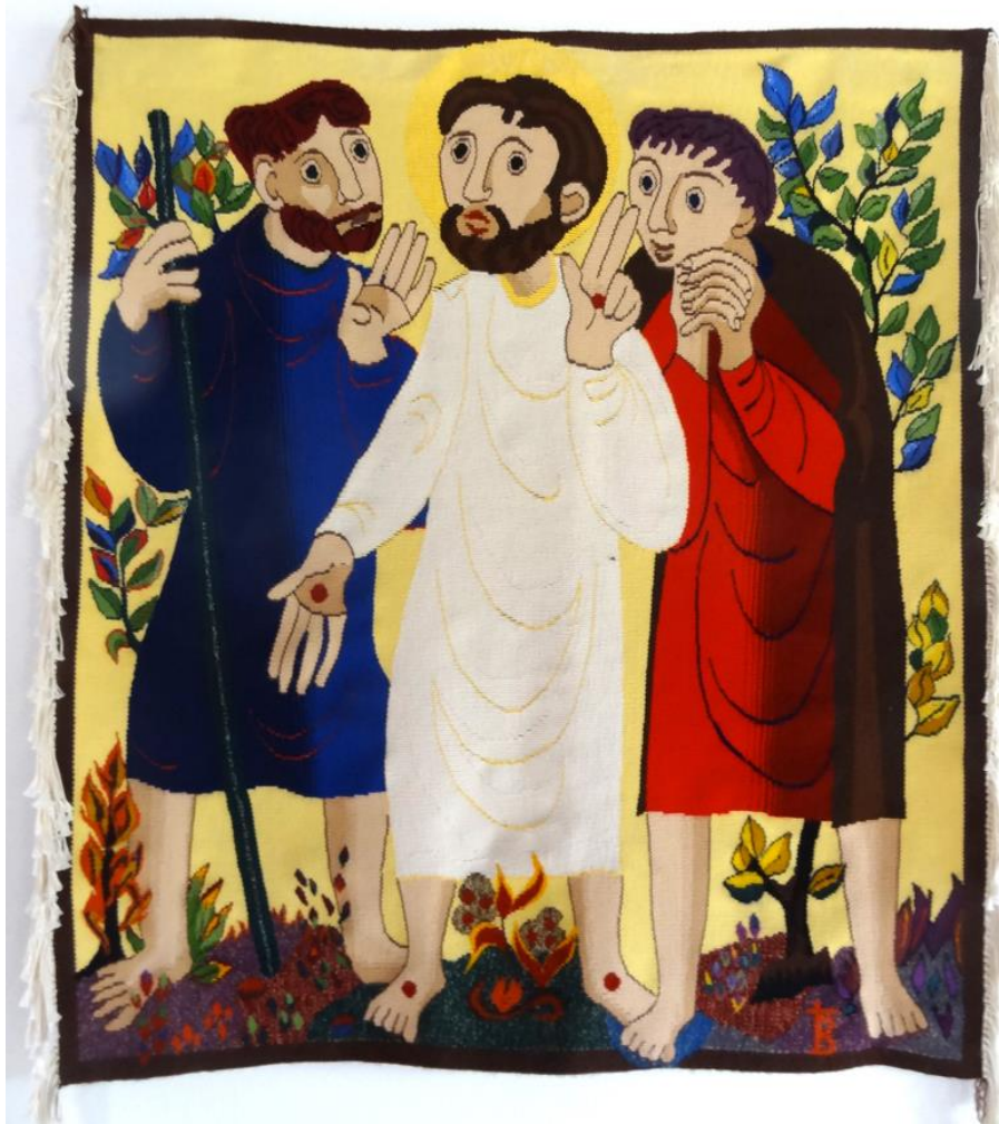
Risen Christ on the Road to Emmaus, after 1965. Bose Monastic Community. Textile. Magnano, Italy.