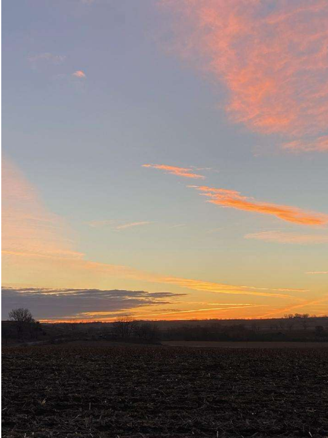
Photo taken this morning on the Soldier River Valley near Moorhead, Iowa by Daryle Lauritsen.